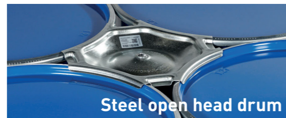
Steel open head drum