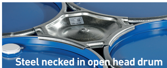
Steel necked in open head drum