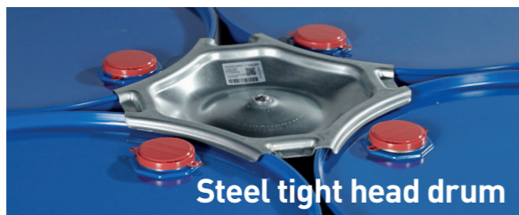
Steel tight head drum