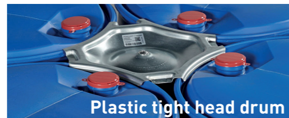
Plastic tight head drum