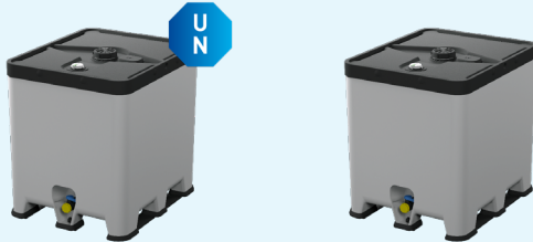
UN and Non-UN